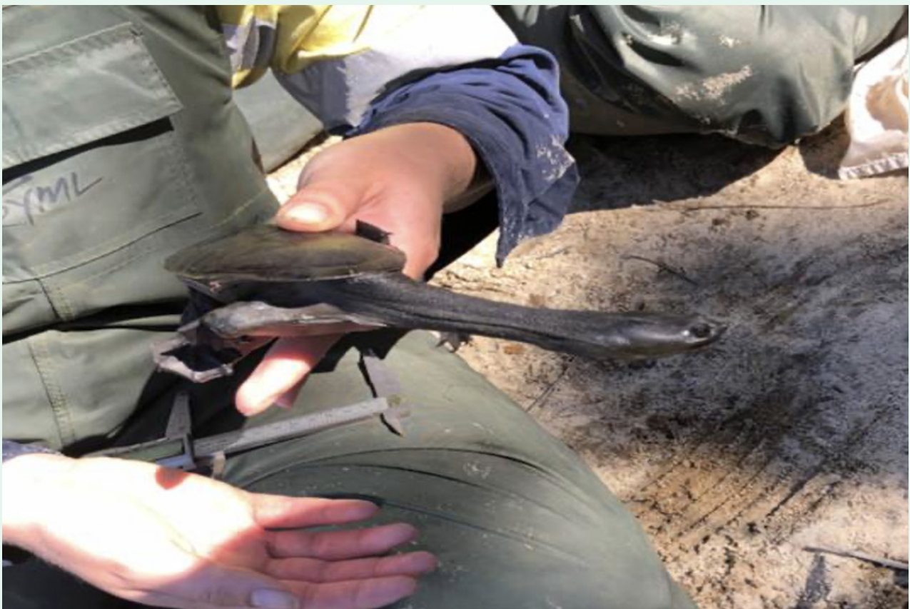
The lakes at the Capel Wetlands are brimming with Oblong turtles! This species is endemic to south west WA

Every year FAWNA cares for orphaned and abandoned joey Western Ringtail Possums. In April 2019, Iluka entered into an agreement with FAWNA to establish and operate a "Possum Finishing School" at the Capel Wetlands. While the Possum Finishing School currently provides a valuable service for the care of orphaned and abandoned fauna, FAWNA's longer term vision is to develop the Capel Wetlands into a biodiversity park and wildlife hospital. Iluka and the Shire of Capel are assisting FAWNA in their evaluation of the feasibility of this concept.