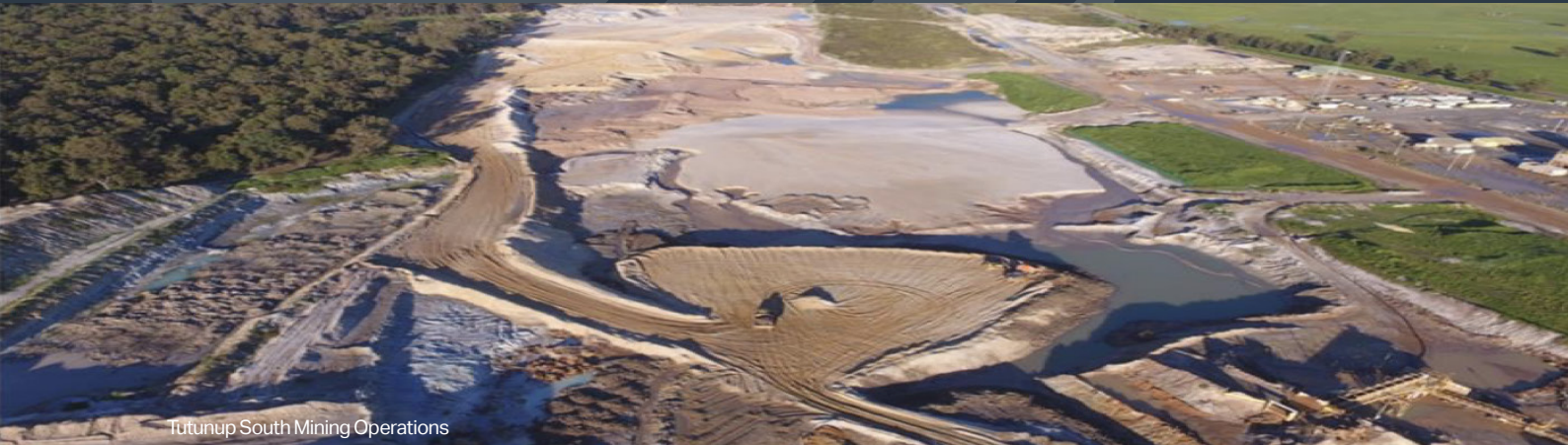
Tutunup South Mining Operations