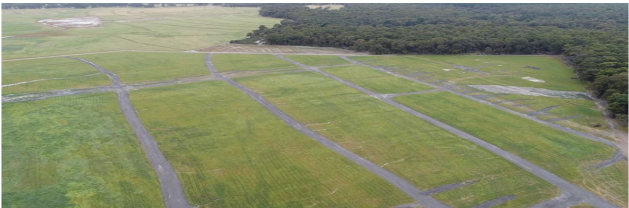
South Tutunup Post Mining Rehabilitation