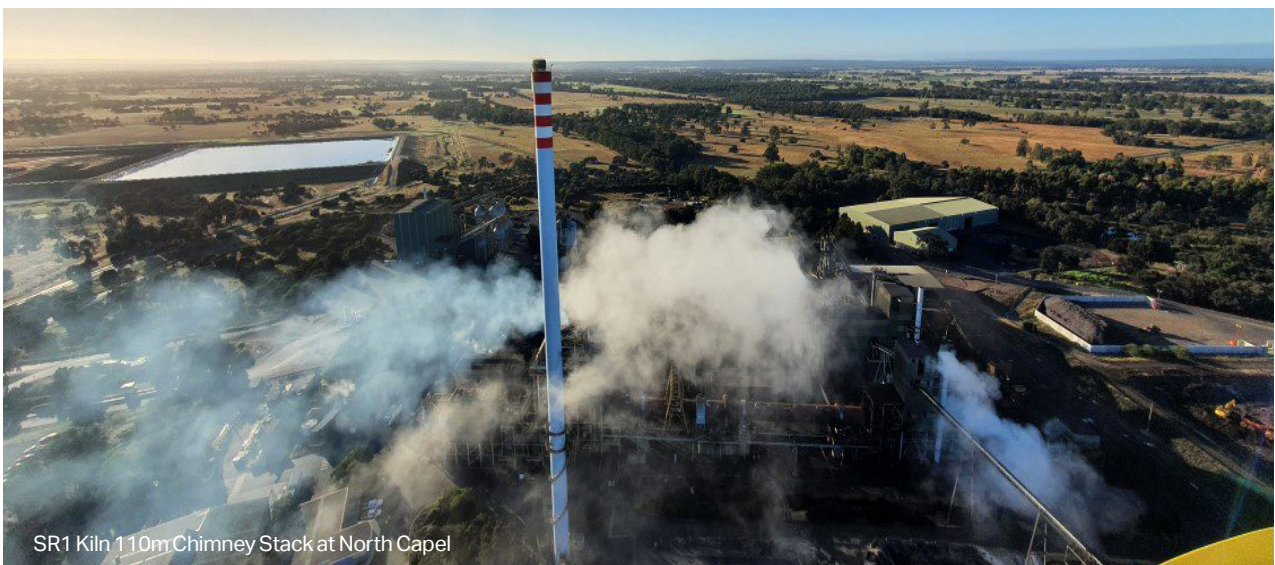
SR1 Kiln 110m Chimney Stack at North Capel

Restarting the SR1 kiln will result in an additional 46 jobs at our North Capel hub. In support of recruiting locally, 70 regional contractors have been engaged to assist with various aspects of the SR1 Restart Project.