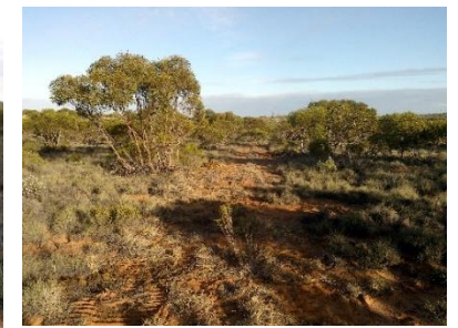
After - drilling and rehabilitation

How can I contact Iluka about exploration drilling in my area? You can contact Iluka directly on 1800 305 993 (24/7) or email <u>communities.support@iluka.com</u>.