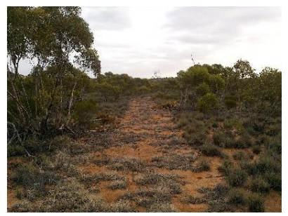
Before - drilling

The photos below show the stages of drilling and rehabilitation at an Iluka site, Yellabinna Regional Reserve, South Australia.