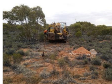
During - Drilling