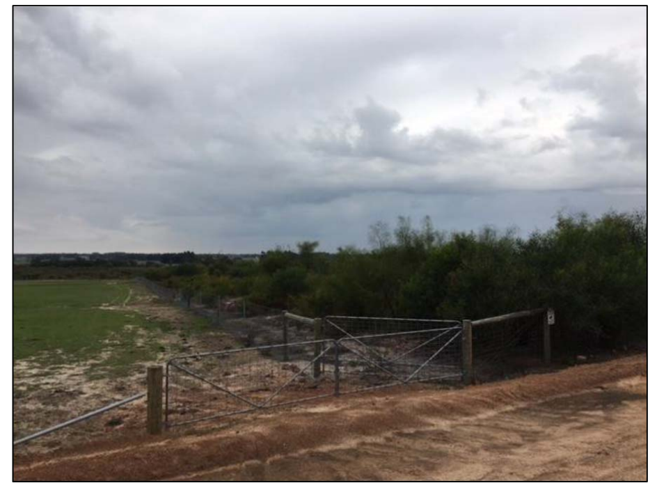
Plate 2: Roberts Block Vegetation Link