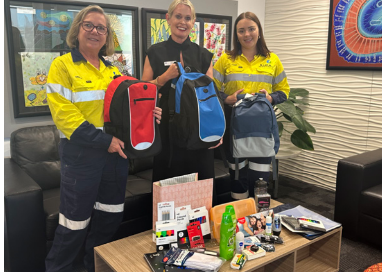
Narngulu admin team members delivering Kindness Kits

In 2024, Iluka's Narngulu site (in Geraldton) provided more than 260 backpacks to students at Waggrakine Primary School, Rangeway Primary School, Chapman Valley Primary School, Champion Bay High School, Geraldton Senior High School and Midwest Engagement Centres.