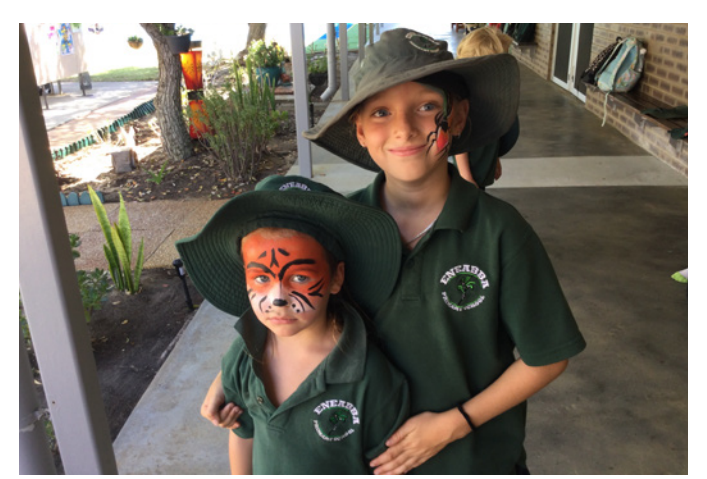
Some happy and healthy students