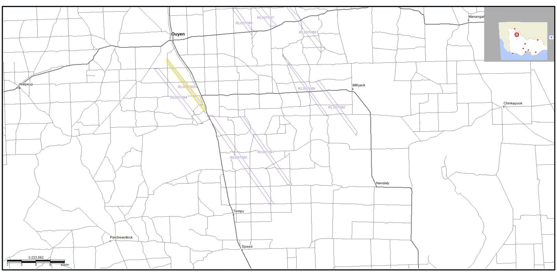
Figure 3: RL007093 Location within wider Victoria