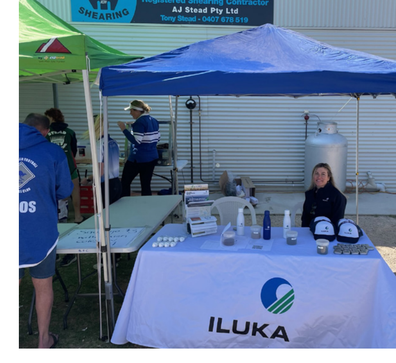
lluka enjoyed attending a home game for the footy finals to support the Balranald Football Netball Club in September

As always, if you have queries about matters relating to the Balranald Project you can email <u>Balranald.Community@iluka.com</u>.