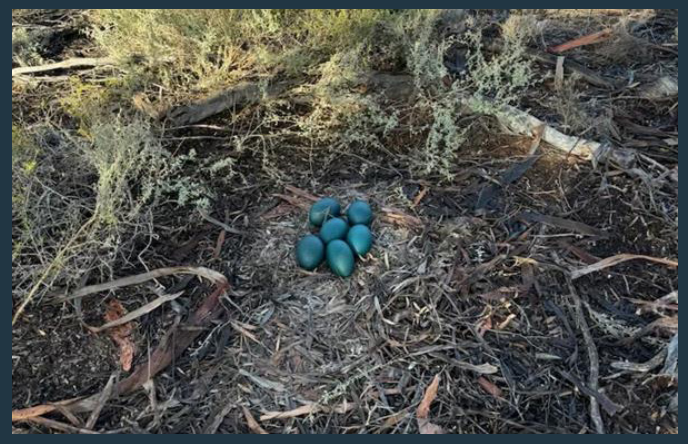
Emu eggs discovered on the project site during a recent cultural heritage survey

In September, we also sponsored the Mildura screening of ' Just a Farmer ' hosted by Northern Mallee Leaders to improve the conversation around mental health in regional and farming communities.