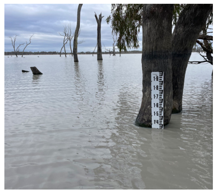
Red Gum Swamp gauge board for surface water monitoring

Revision and update of technical assessments for mining, groundwater, surface water, ecology, noise and vibration, landscape and visual, traffic and transport, soil, land use planning, agriculture, historical heritage and bushfire to reflect refinements of the project scope has continued. Assessment and report development for the air quality, radiation and geotechnical assessments is also underway.