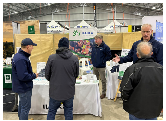
The Iluka team at Sheepvention in August

It's been fantastic to meet some of the hard-working volunteers behind these projects in recent months. If you or someone you know is interested in applying for future lluka Lends a Hand funding, please get in touch.