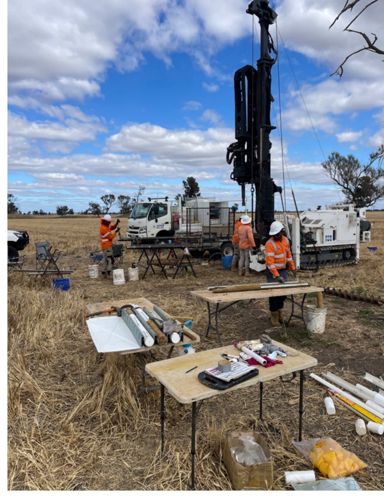
Geotechnical drilling taking place on the Wimmera Project site

Out in the field, routine monitoring for groundwater, surface water and radon has continued, and two new bores were established at the northern and southern ends of the Jallumba Marsh reserve. Noise monitoring was also undertaken at key locations along the proposed transport routes to inform the traffic and transport study.