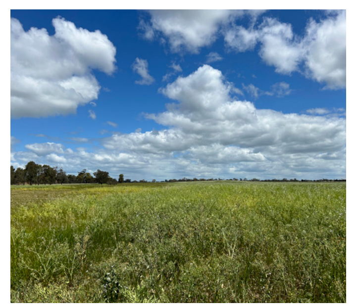
Rehabilitated land at the Douglas site

Rehabilitation efforts in 2024 in the Murray Basin are progressing well, with 54 hectares of land fully rehabilitated at the Douglas site . With the completion of another two pits, efforts have shifted to focus on Pit 22 and the tailings storage facility. Pasture and tillage crops at the Douglas site continue to reflect Iluka's commitment to best-practice rehabilitation, showcasing the successful integration of sustainable agricultural practices. Further north at Iluka's former WRP mine site, recent dismantling of the mining unit has paved the way for further rehabilitation activities which will continue throughout 2025.