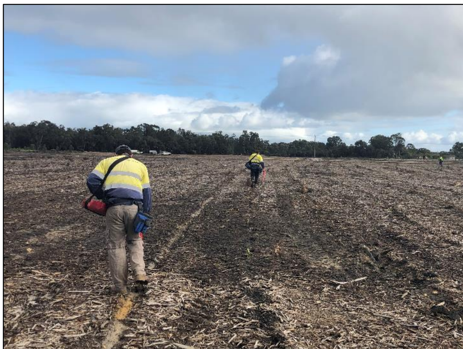
Plate 2 – Tubestock Planted Along Rip Lines