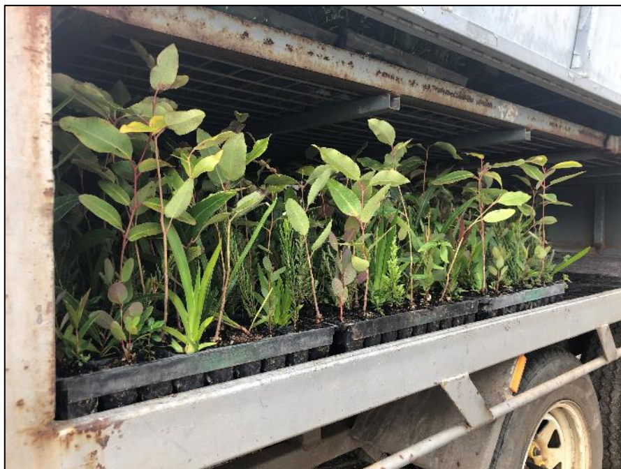
Plate 4 – WRP Offset Area Tubestock