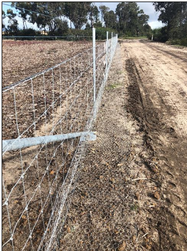
Plate 1 – WRP Offset Area Perimeter Fence