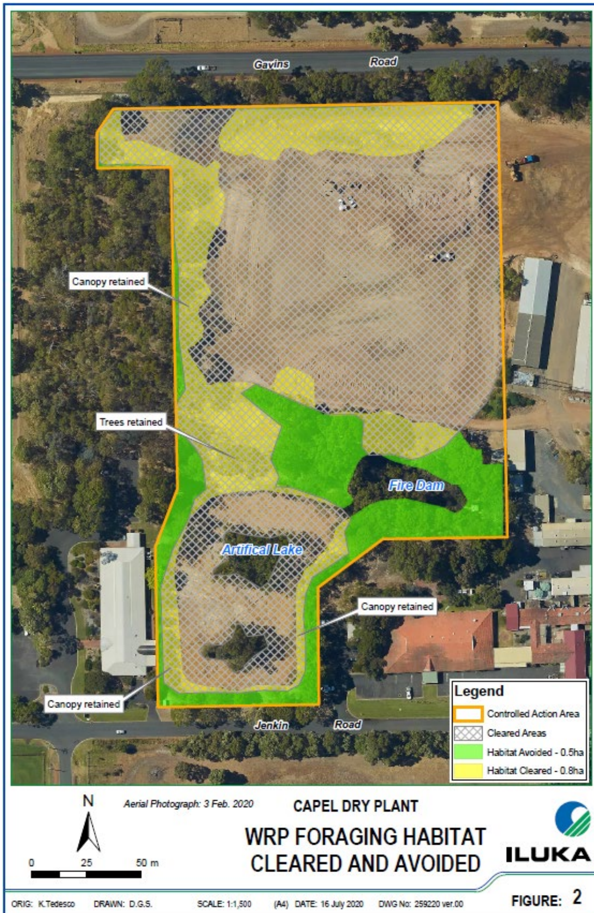
Figure 2 – Capel Dry Plant WRP Disturbance Area