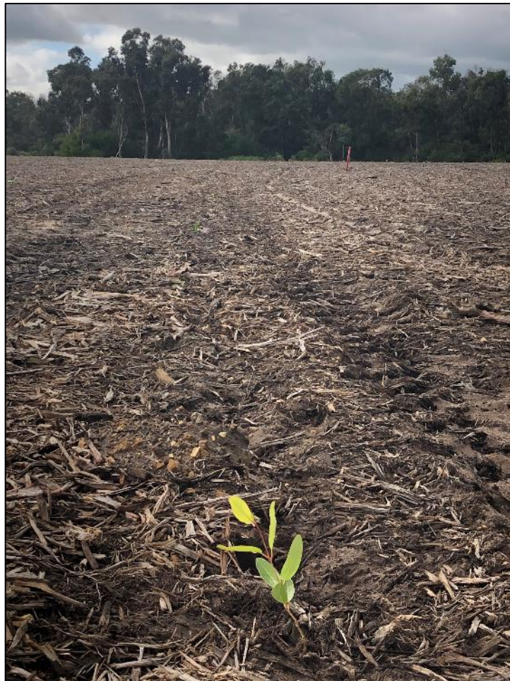
Plate 3 – Mulched Surface of the WRP Offset Area