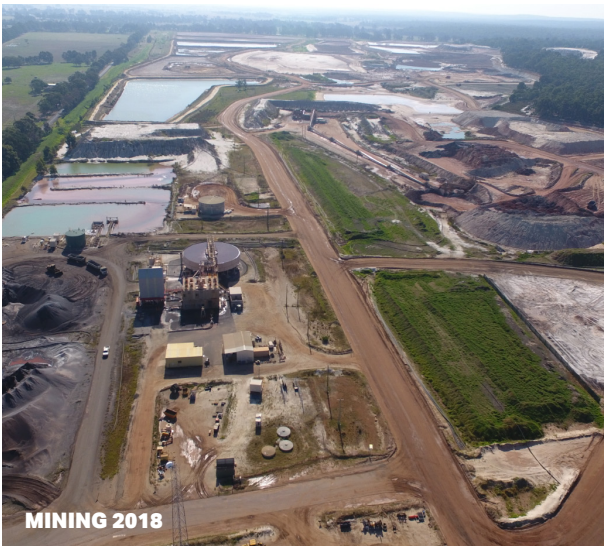
Rehabilitation of mined areas at Tutunup South